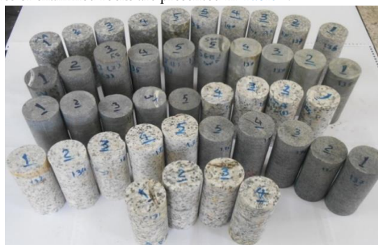
Fig. 2. Some of prepared specimens for mechanical tests.

ISRM standards [43], the Uniaxial Compressive Strength (UCS), Schimazek Factor of abrasivity (SF-a), Mohs Hardness (MH), and Young's Modulus (YM) were measured. The physical and mechanical features of examined rocks are presented in Table 2.