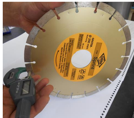
Fig. 5. A digital micrometer to determine the wear rate.