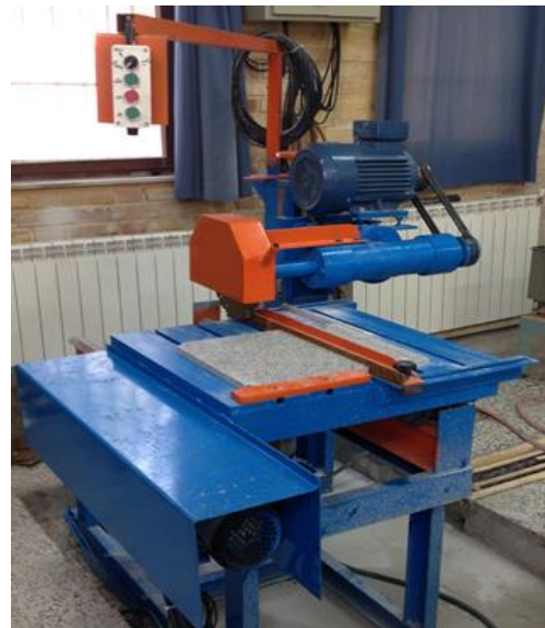
Fig. 4. A fully-instrumented laboratory cutting rig.

In this study, a circular diamond saw of a 250-mm diameter, and a steel core of 50-mm thickness were utilized. Eighteen pieces of impregnated diamond segments with a size of 35 mm×2.5 mm×6.0 mm were brazed to the periphery of a circular steel core, which had a standard narrow radial slot. Two different saws were applied to 14 rock types in this study. The diamond had a grit size of about 50/60 US mesh at concentration 35. Ampere consumption and wear rate of diamond saw were selected as criteria to evaluate the result of ABC algorithm. Ampere consumption was determined during the cutting process using a digital ampere meter. The average wear rate of diamond saw was calculated from loss of width, length and height using a digital micrometer (Fig. 5). The ABC result and cutting performance parameters such as wear rate of circular diamond saw and ampere consumption are given in Table 5.